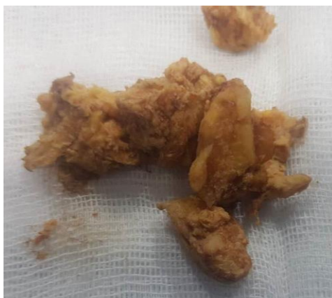
Fig 3. Remnant of removed gastric bezoar (persimmon)