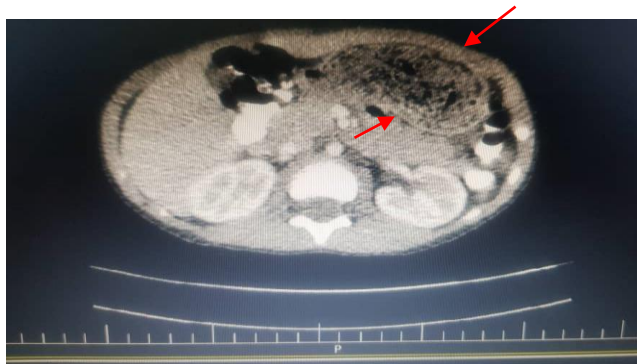
Fig 1. Gastric bezoar presentation in abdominal CT scan with contrast agent

Treatment of the patient included 0.5 mg/kg Plasil (metoclopramide) ampoule every 8 hours and consumption of 1 liter of lemonade or cola daily. In the first session of gastroduodenoscopy, a soft drink injection with a sclerosing needle was introduced into different parts of the mass. Fragmentation was performed with alligator and snare forceps. This procedure was performed in 3 gastroduodenoscopic sessions one day apart. The mass was also cut and fragmented electrically with the snare during dissection. Rigid bezoar pieces were completely removed during the gastroduodenoscopy sessions using a snare and basket. Finally, in the fourth session, all pieces of bezoar (persimmon) were removed and the stomach was cleaned (Figure 3). The patient was discharged one day later, after five days, in good general condition. After one month, he had no more complaints at the follow-up examination.