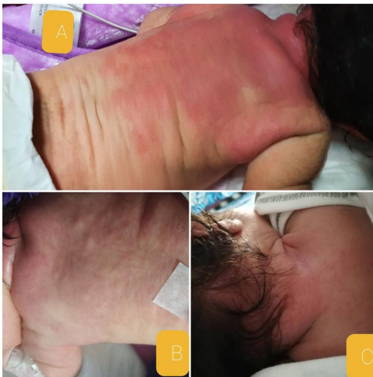
Figure 1. A=Skin lesion caused by subcutaneous fat necrosis on day 4 of life; B: Nodules on the back in the middle of erythematous plaque; C=Significant improvement after 3 weeks

In the examination of the infant in the eighth month of life, the infant was completely normal and no developmental delay was observed. He is socially aware and rapidly responded to visual objects. The independent sitting is accomplished by 6 months and had good sitting posture. The baby was able to pick up an object and had a whole hand grasp. The head circumference was measured and plotted and was within the normal limit.