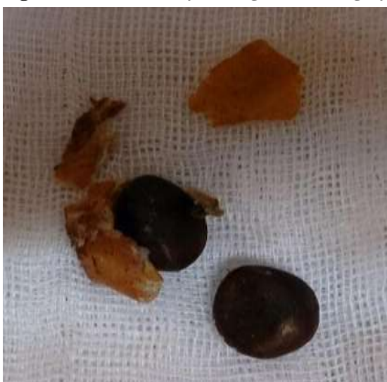
Figure 2: Foreign bodies (loquat)