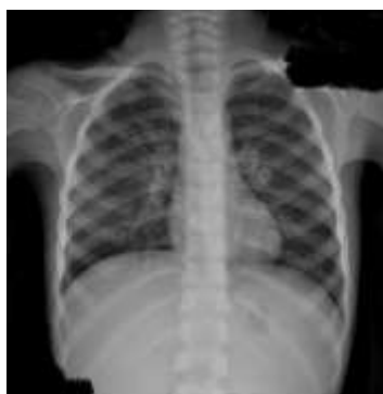
Figure 1. Chest X-ray of our patient

Other investigations included HIV test, immune system evaluation, and CH50, which were negative. The abdominal CT scan illustrated the multiple lesions in the terminal ileum with a pattern of inflammatory diseases (fig 2). Although EBV was the cause of the disease, cervical lymph node biopsy was performed. As a result, Hodgkin lymphoma was found and he was treated with chemotherapy.