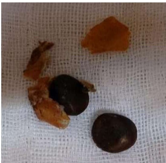
Figure 2: Foreign bodies (loquat)