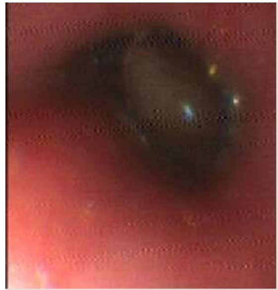
Figure 3: Endoscopic finding (foreign bodies in the esophagus)