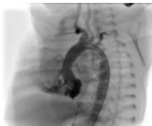
Figure 2: Coarctation of aorta