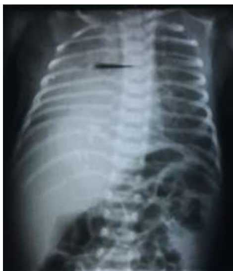
Figure 1. Chest radiograph illustrates the cardiomegaly and displacement of cardiac structures into the right hemithorax.

The hypoplastic right lung and anomalous pulmonary vein confirmed the diagnosis of CPVLS, also known as syndromes.