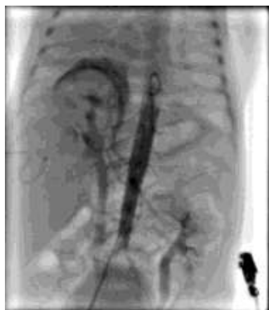
Figure 5. Anomalous right lower pulmonary artery originated from abdominal aorta