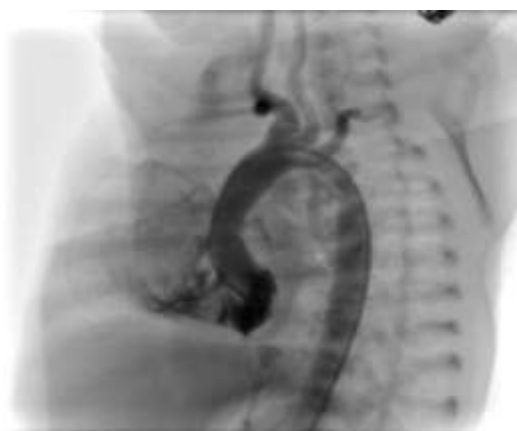
Figure 2: Coarctation of aorta