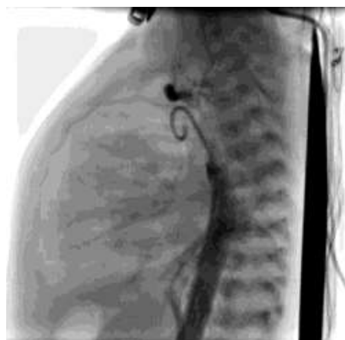
Figure 3. PDA