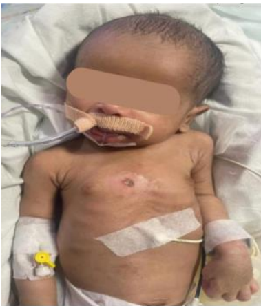
Fig 2. Baby on the 19th day of life ventilated due to deterioration of sensory function