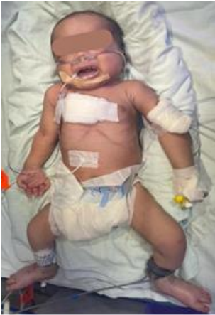
Fig 1. Baby at the time of admission (14th day of life)

A neurosurgical consultation was performed and the baby underwent surgery for hydrocephalus with the right medium-pressure ventriculoperitoneal (MPVP) shunt, after which the sensorium temporarily improved. Finally baby was discharged after 10 days of post operative care