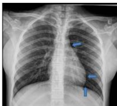
Figure 1. CXR shows lucency (air) along with mediastinum and between the heart and superior surface of the diaphragm