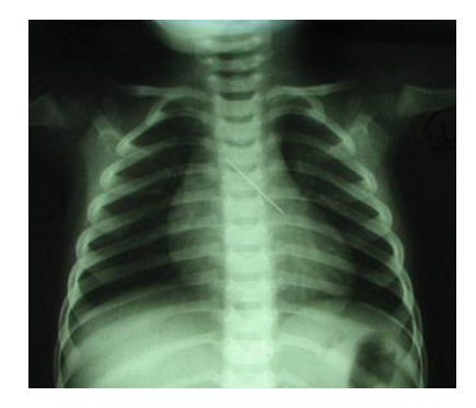
Fig 1: Chest X-Ray; the metallic pin is seen at the mid site of the chest in oblique direction to the left side

The size of metallic pin was 4cm in length and had a pearl head (Fig2). Chest X-Ray was normal after broncoscopy. He was observed for 24hrs in pediatric intensive care unit (PICU). The patient was discharged without any complication. After one week follow up, he was well and had no sign and symptom of respiratory system.