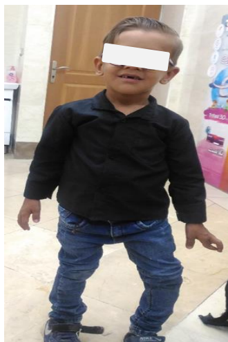
Fig. 1. Leg deformity, genu varus and short stature of patient

kidney stones, and structural disorders of the kidney, but in this study, the possible cause of hematuria is nephrocalcinosis confirmed by ultrasound.