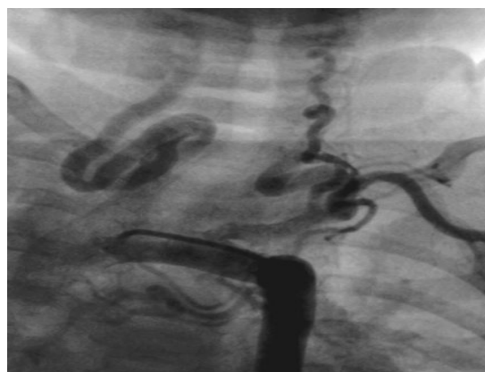
Figure 1: Tortuosity in aortic arch branches (brachiocephalic and carotid)

Right oxygen saturation was normal but the right ventricular pressure was increased to 60 mmHg. The pressure between pulmonary trunk and it right and left branches was 40 mmHg. There was a slight right ventricular hypertrophy with severe stenosis of pulmonary artery bifurcation site (peripheral pulmonary stenosis, type II-A) (fig 3). The patient is survive after one year follow up and didn't need any intervention for her cardiac problem right now.