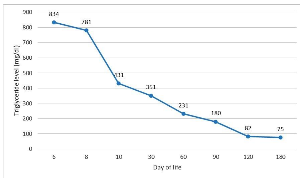
Figure 2: Serum triglyceride levels from admission till 6 months of age