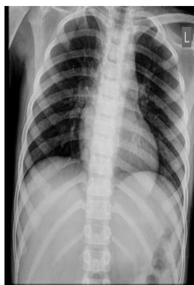
Figure 2. Chest X-ray after three days of bronchoscopy shows normal findings.